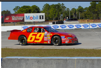
Historic Stock Car Racing