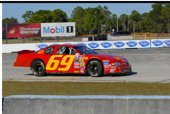
Historic Stock Car Racing