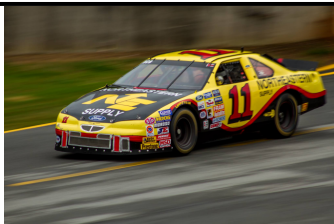
Historic Stockcar Racing