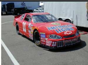
Historic Stock Car Racing