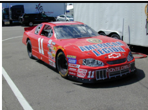
Historic Stock Car Racing