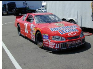
Historic Stock Car Racing